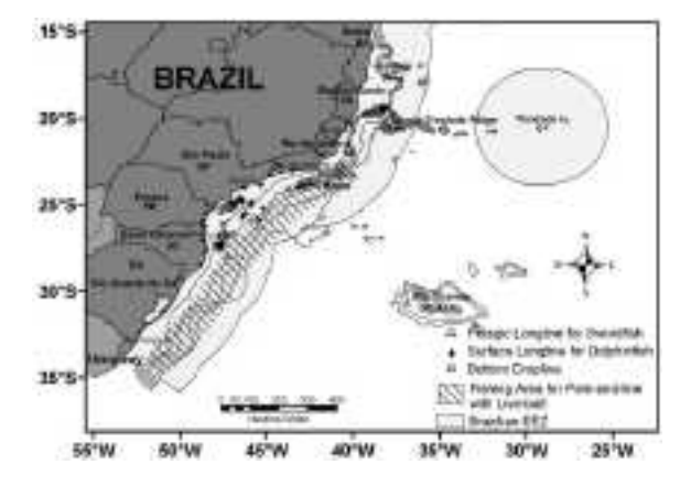
Fig. 2. Sets of surface longline for Dolphinfish, Coryphaena hippurus , pelagic longline for Swordfish, Xiphias gladius , and bottom dropline sampled by onboard observers in Brazil from 2004 to 2006. Shaded area corresponds to the fishing grounds for the pole-and-line fishery using live bait and targeting Skipjack tuna.

The bottom dropline, locally named 'pargueira', is an artisanal gear with some variations, used to target large fish over